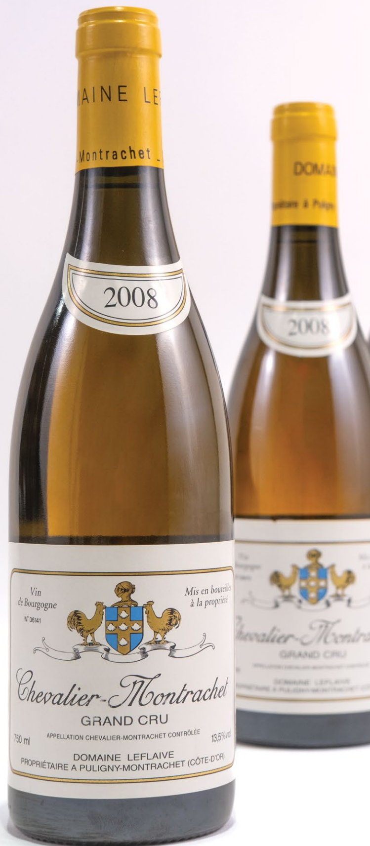
Lots 109 & 110