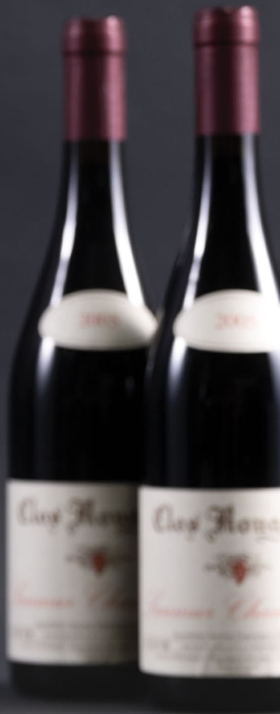
Lots 248 & 249