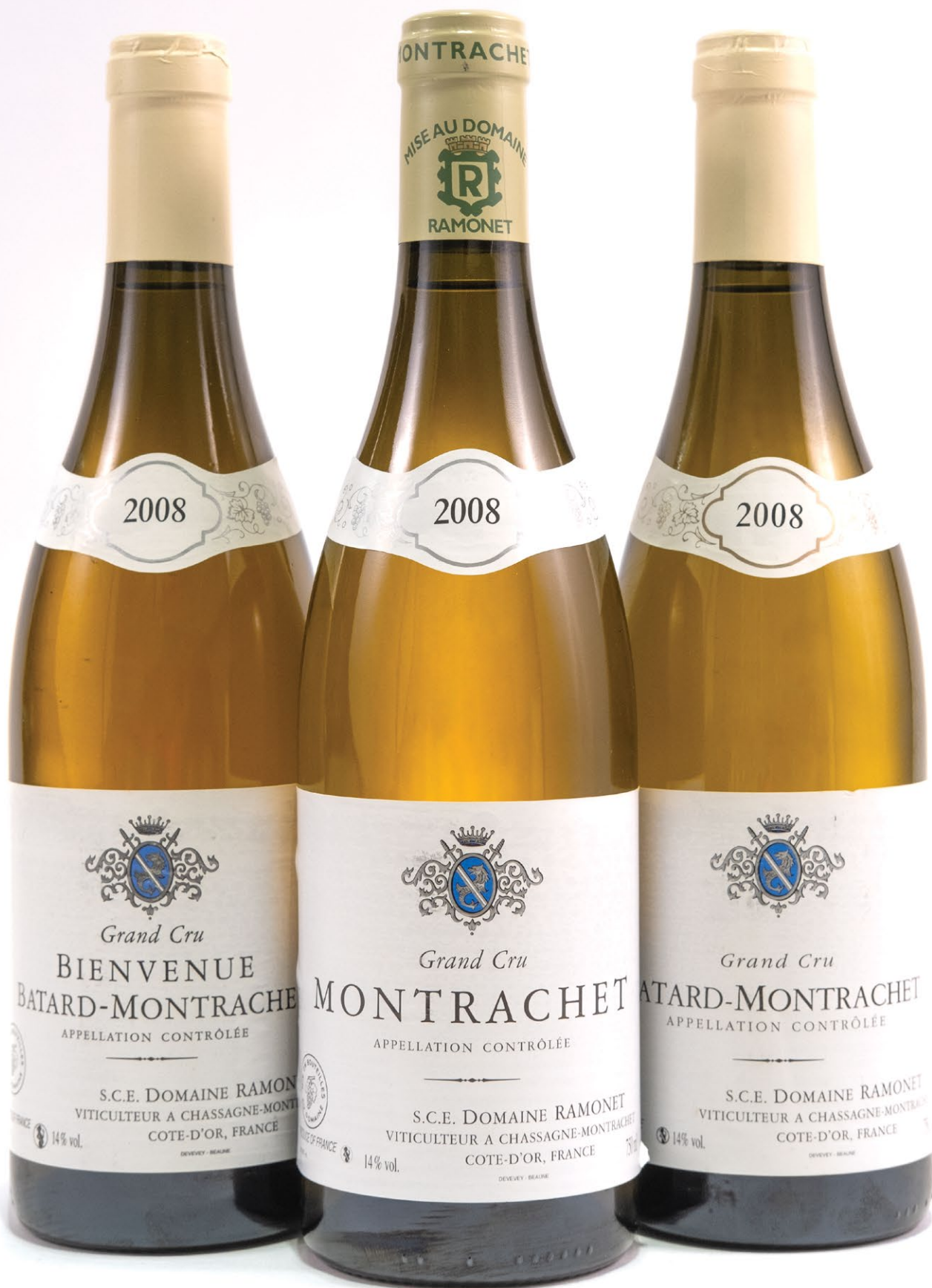
Lots 119-122, 126-130 & 149